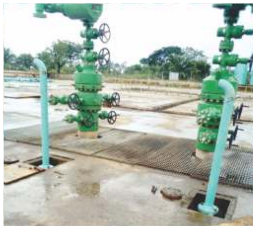
Installation of Well Hook up Spools for Njaba End Facilities.