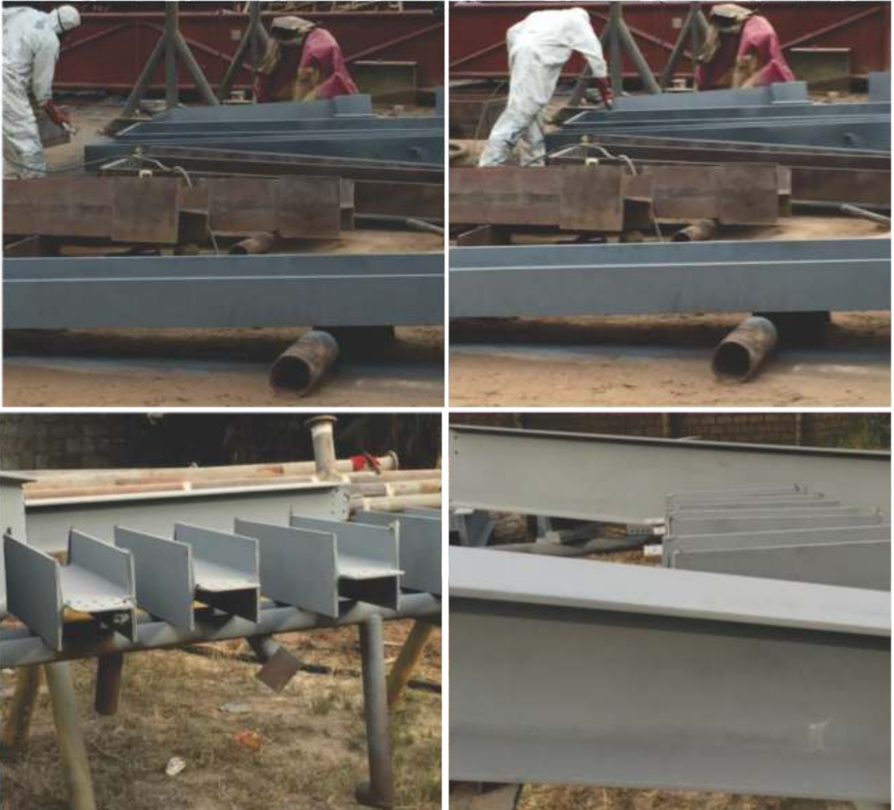
BLASTING AND PAINTING OF FABRICATED STRUCTURAL MEMBERS.