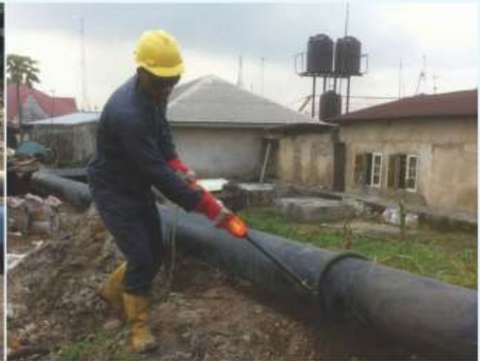
Holiday Detection Activity on 12" Bulk Crude Line X14KM in OML 124 for LNL/ADDAX Petroleum.