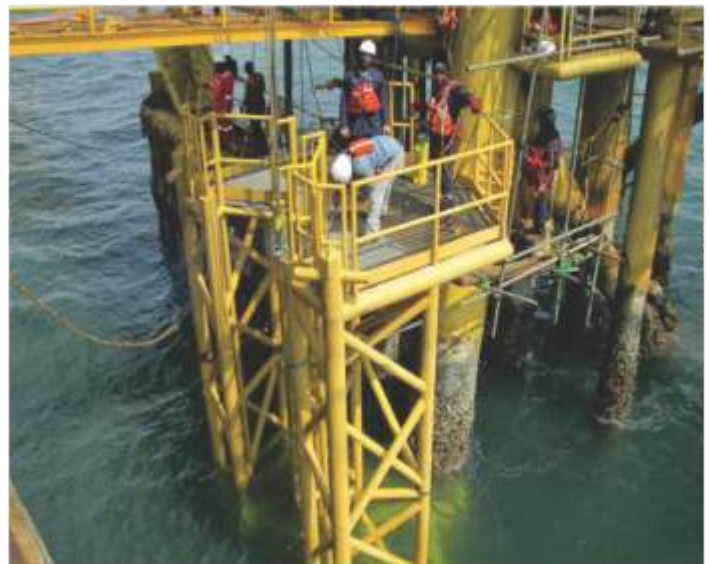
Top sides installation of Oron WS. KITA Marine &akam Boat Landings by STRUGA SERVICES LTD /ASCOT for APDNL