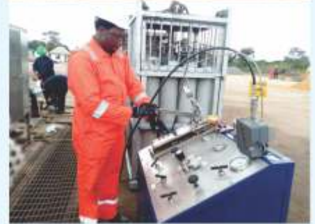
Callibration of Switches and Instrumentation Equipment for Njaba End Facility Project.