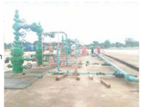
Installation of Well hook up spools, Gas lift lines, Instrumentation Equipment on going at Njaba Field.