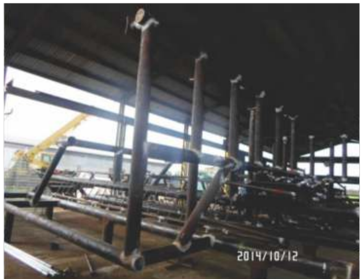
NDT on fabricated Oron WP, ADNB, TMMP, ADPP and Ebughu Boat Landings by STRUGA SERVICES LTD /ASCOT for Addax Petroleum