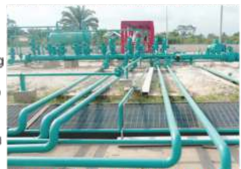
Complete Installation & Commissioning of Njaba Process(END) Facilities by STRUGA SERVICES LTD