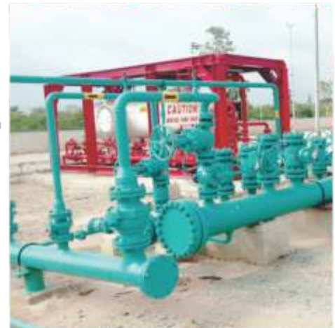
Complete Installation of Njaba Manifold by Struga Services Ltd.