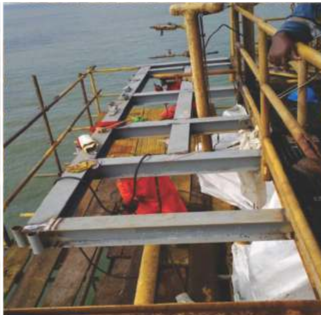
Onshore fabrication and Offshore installation of ADS Deck Extension and Security Hardening Project by STRUGA SERVICES LTD/OIS For Addax Petroleum.