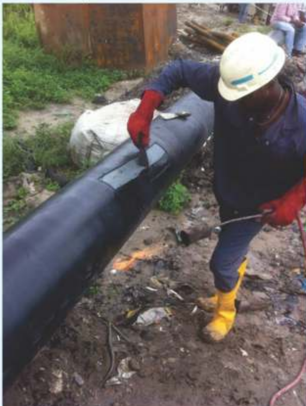
Field Joint Coating