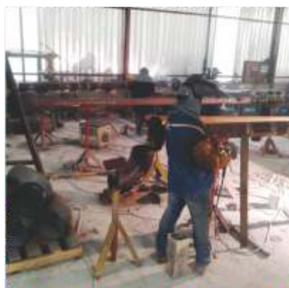
Yard fabrication of Spools for Njaba End Facilities.