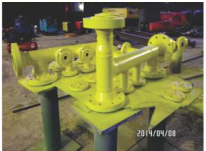
Onshore fabrication and Offshore Installation Of KTM 13& 14 Well Hook-up Spools by STRUGA SERVICES LTD /ASCOT for Addax Petroleum.