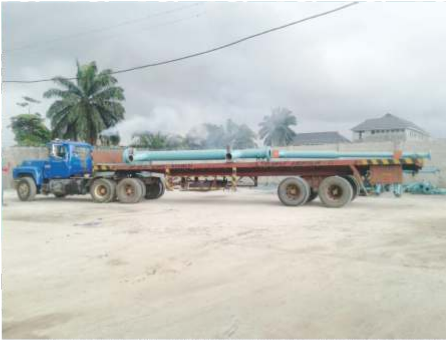
Load out of Fabricated spools and supports for Site Installation works at Njaba Field.