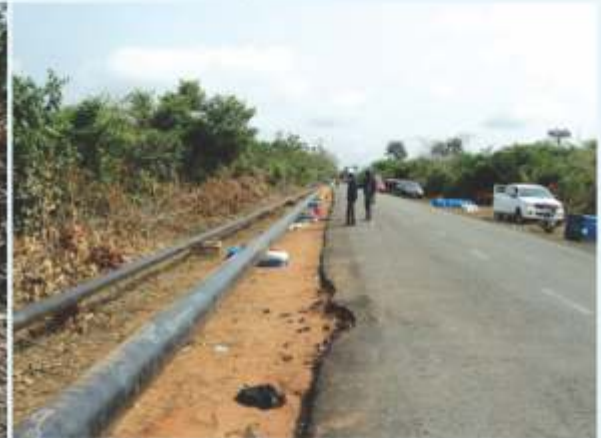
Holiday Detection Activity on 6" Gas Lift Pipelines X14KM in OML 124 for LNL/ADDAX Petroleum.