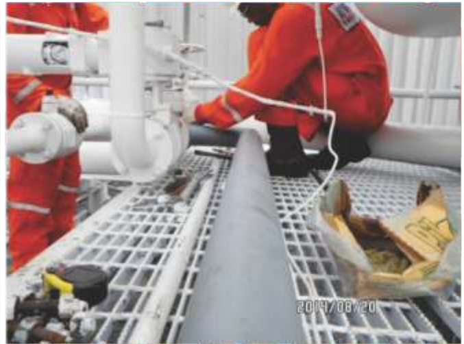
Repair on Pinhole leak on Izombe V300 Water outlet by STRUGA SERVICES LTD/OIS for Addax Petroleum.