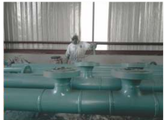
Painting of Fabricated Spools for Njaba End Facility Project.