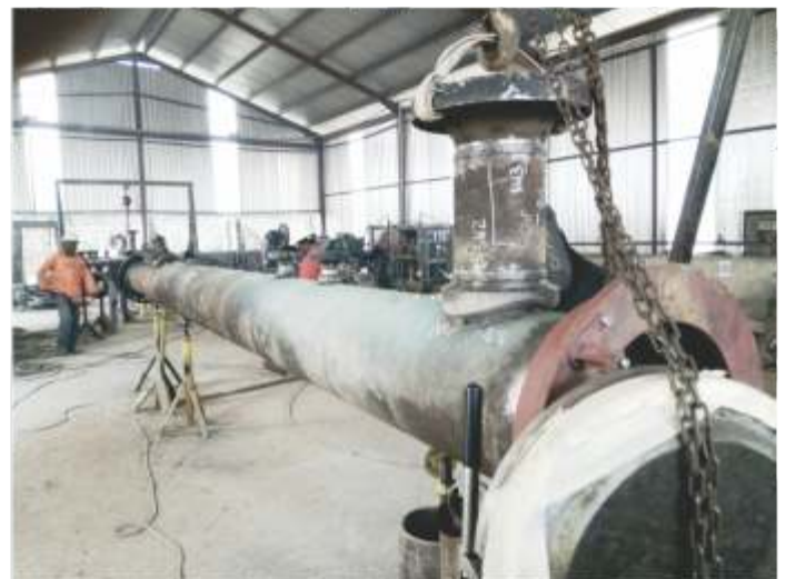
Fabrication of 12 inch & 6 inch Pig launchers & Receivers for Njaba End Facility project.