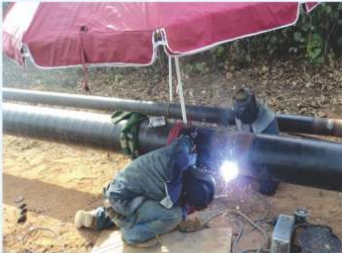
Construction of 12" bulk crude line and 6" Gas Lift Pipelines X14KM IN OML 124 for LNL/ADDAX Petroleum.