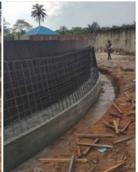
Construction of 26 Metre Diameter Tank Base Agwa Flow Station.