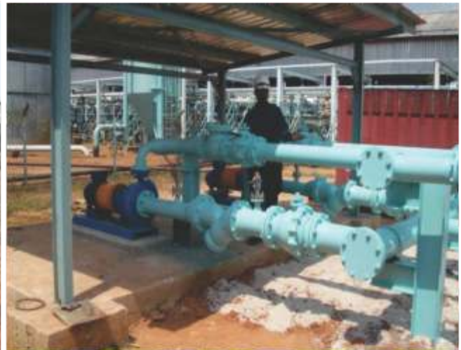
Piping fabrication and site Installation Of T-2500B Booster pump pipeline at Izombe Flow Station By STRUGA SERVICES LTD /ASCOT for Addax Petroleum