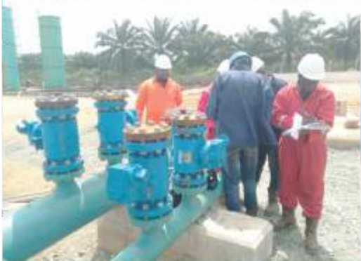
Installation of Manifolds and Appurtenances.