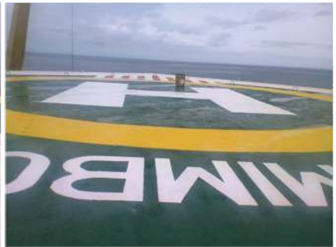
Blasting & Painting of 5NOS Offshore Helideck Production by STRUGA SERVICES LTD /ASCOT For Addax Petroleum