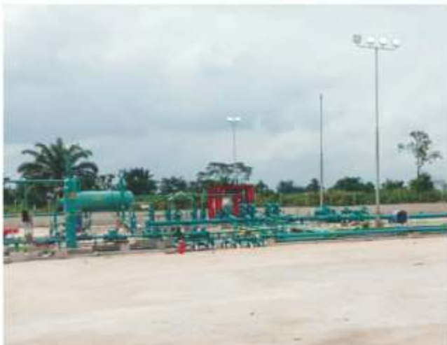
Complete Installation and Commissioning of Njaba Process (END) Facilities by STRUGA SERVICES LTD