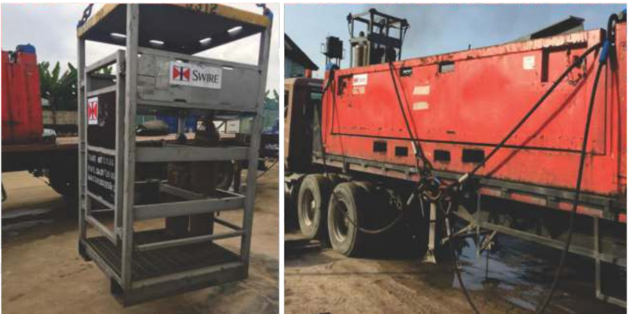
LOAD-OUT OF STRUCTURAL MEMBERS.