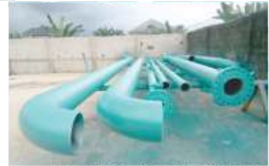
Complete Fabrication and painting of 12 inch Manifold Spools for Njaba End Facility project.