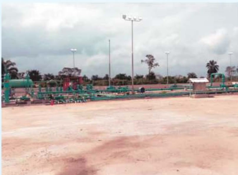
Complete installation and commissioning of Njaba Process (END) Facilities by STRUGA SERVICES LTD