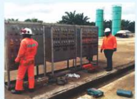
Installation of Well Head Control Panel