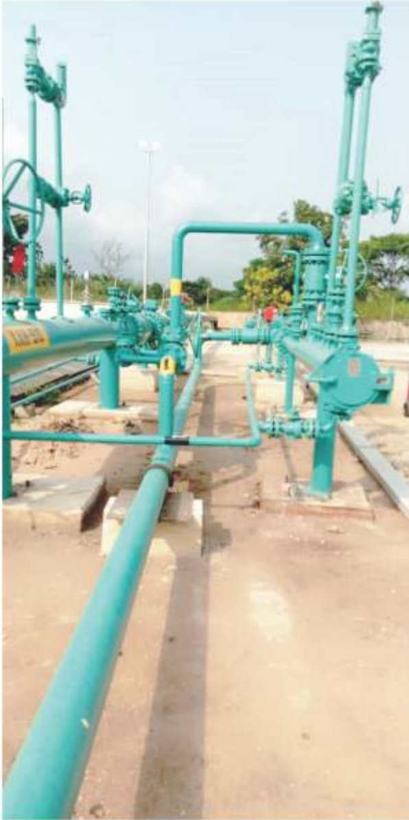
Complete Installation and Commissioning of Njaba Pig Launcher and Receiver by STRUGA SERVICES LTD