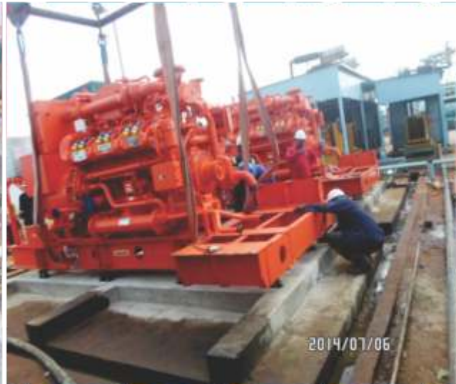
Installation of 2NOS Gas Fueled Generator at Izombe Flow Station by STRUGA SERVICES LTD /ASCOT for Addax Petroleum