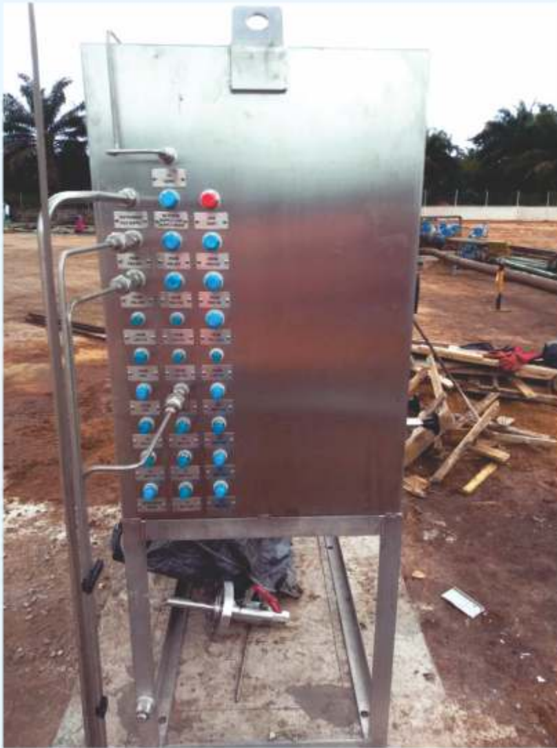
Installation of Master Control Panel for Njaba End Facility.