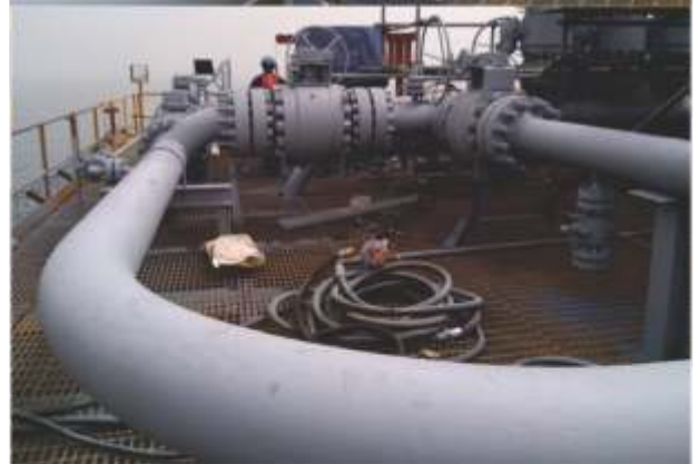
Blasting and Painting Of ADSI Water Injection Platform for Addax Petroleum.