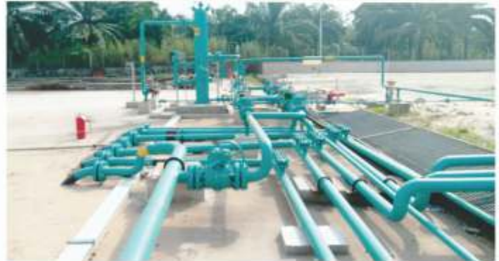
Complete Installation of Njaba Well hook up, Gas lift lines, Gas Scrubber and associated pipings by STRUGA SERVICES LTD