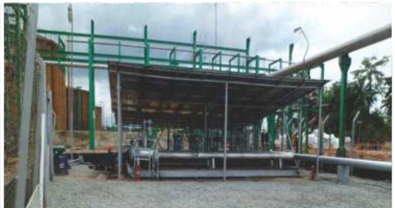
Rehabilitation of Addax Metering Skid_ Ebocha by STRUGA SERVICES LTD/OIS for Addax Petroleum