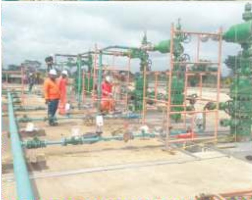
Installation of Manifold Spools, and Integration of associated Well hook-up spools.