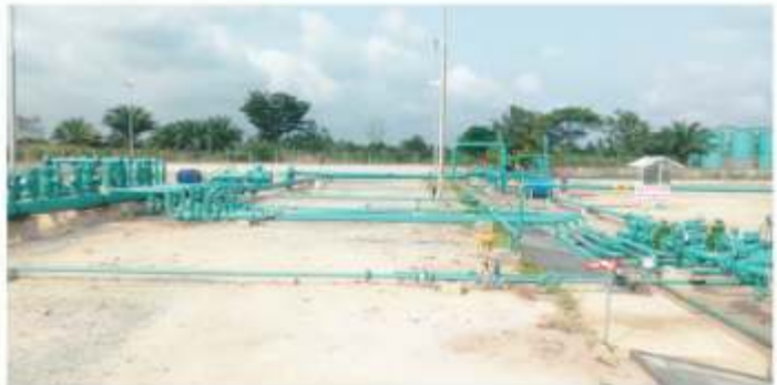
Complete Installation and Commissioning of Njaba Process (END) Facilities by STRUGA SERVICES LTD