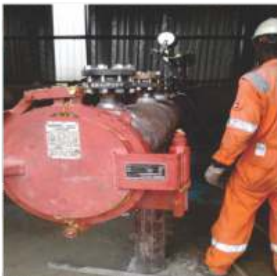
Hydrotest of Pig Launchers and Receivers for Njaba End Facilities Project