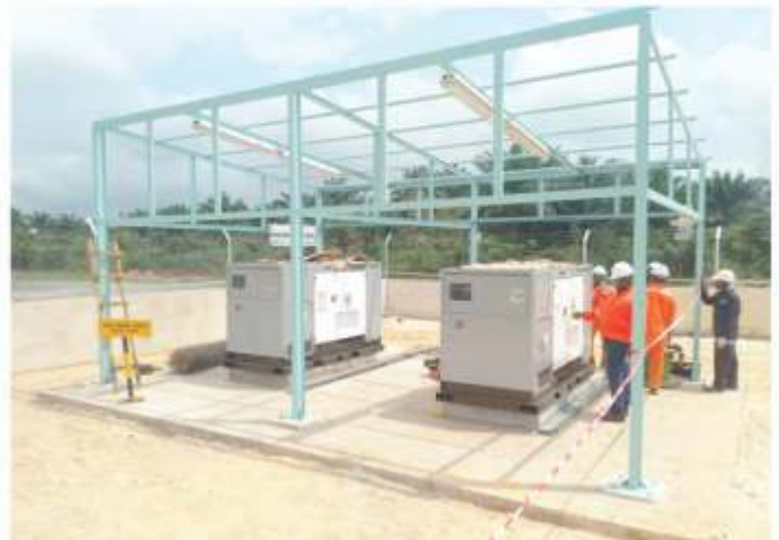
Installation of Gas Generators and Shelter for Njaba End Facility Project.