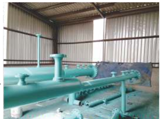
Complete fabricated and adequately Painted Pig Launchers and Receivers for Njaba End Facility Project.